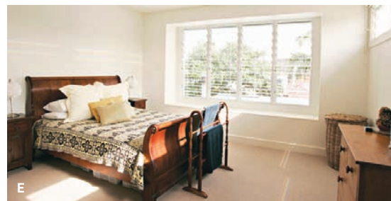
A James McNally B The new extension C A stainless steel work area features in the kitchen D The north-facing bathroom E The main bedroom